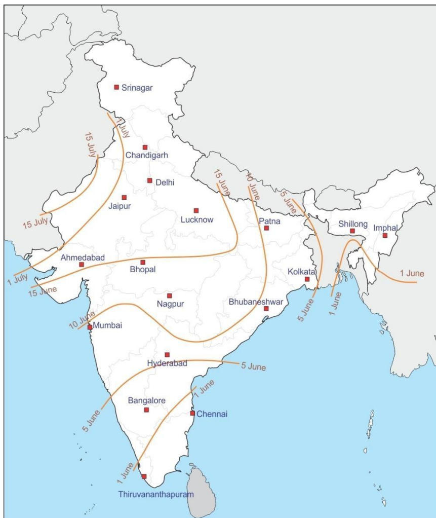
Map showing direction of Southwest monsoon winds in India

Although the monsoon winds are irregular and uncertain, they unify the entire country. The farmers eagerly wait for the arrival of rainfall. Rainfall provides the water required to set agricultural activities in motion. Its arrival is welcomed with the celebration of festivals, singing and dancing.